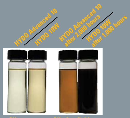
Oil at start Oil after field test